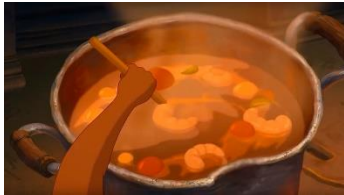
The Princess and the Frog