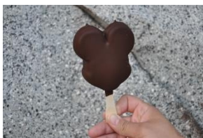
Mickey Mouse Ice Cream Bar