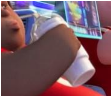
Wall - E