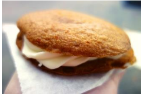
Carrot Cake Cookie