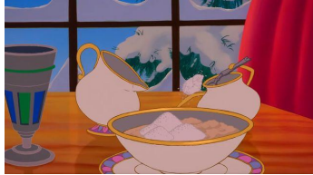
Beauty and the Beast