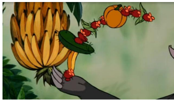
The Jungle Book