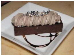
The Grey Stuff