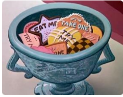
Alice in Wonderland