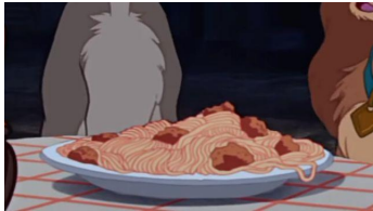
Lady and the Tramp